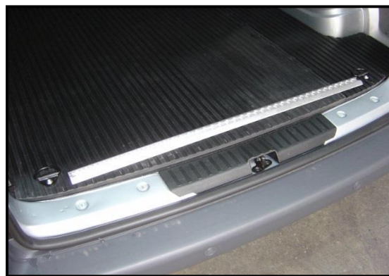
Aluminium protective rail located at the rear